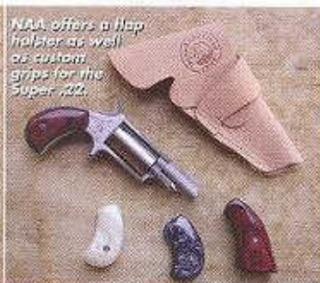
NAA offers a flap holster as well as custom grips for the Super .22.