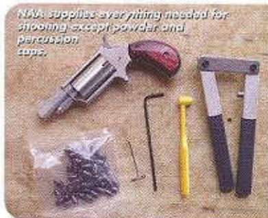
NAA supplies eye pitting needed for shooting, except powder and percussion caps.

and cap and always be able to load their own. Gunshops and hardware stores supplying ammunition were definitely few and far between. Today thousands upon thousands of shooters still enjoy hand loading their own the old way, and virtually every percussion revolver of the 19th century has been replicated for the pleasure of 21st century devotees of the Holy Black. There's something about black powder shooting that gets into the mind, soul, body, and spirit and we are willing to put up with the required hand loading as well as the smoke, the smell, and the cleanup mess.