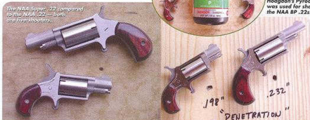
The NAA Super .22 compared to the NAA .22 — both are five shooters.